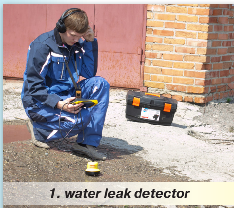
1. water leak detector

Success TPT-522 is a unique set - It consists of 3 kits: