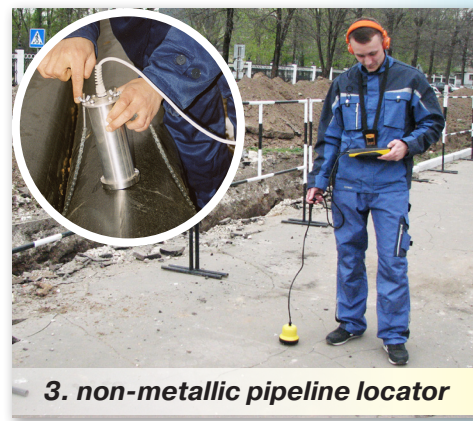
3. non-metallic pipeline locator

For detection of cables and metal pipelines underground up to 6 m depth