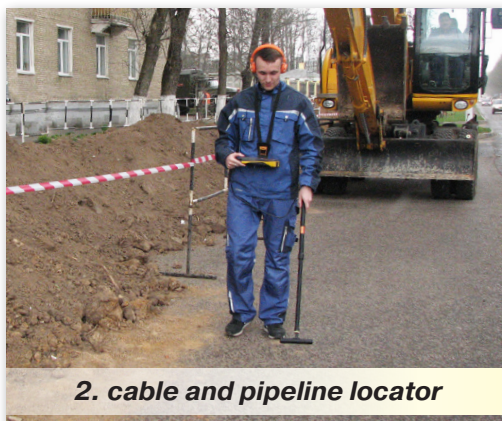
2. cable and pipeline locator

For water leak detection from metal and plastic tubes inside the house and up to 6 m depth underground